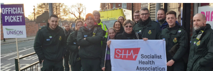
SHA Greater Manchester with ambulance staff

Governments since Margaret Thatcher have banned solidarity action. Today the only way health workers and others can defend their pay and conditions is through taking industrial action themselves. Without such action, public services will wither and collapse through ever increasing staff shortages. There is no contradiction between campaigning for good pay and working conditions and patient safety, they are two sides of the same coin.