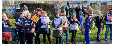
SHA Cymru backs nurses (Neath - Port Talbot).

The SHA is organised into a number of branches in England, Scotland and Wales and our Welsh and Scottish organisations relate to their Senedd and Parliament as appropriate. This provides valuable insight in resolving health issues practically.