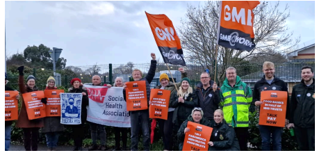
SHA members join picket lines in Worthing.

to defend a publicly funded and provided service. We need to extend these principles to social care.