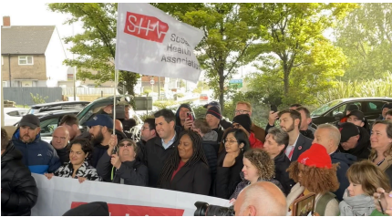
With Labour MPs supporting Liverpool dockers.

We have representation at many levels of the Labour Party, links with unions, councillors, constituency parties and MPs. We also work collectively with health campaigns and recognise the importance of internationalism; disease recognises no national boundaries and people fleeing war, poverty and environmental crises must be supported.